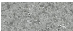
Light Grey 701