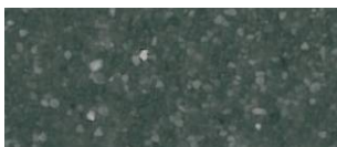
Dark Grey 703