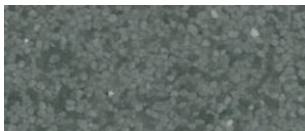
Mid Grey 702