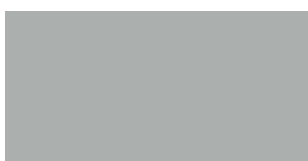
Goosewing Grey 222