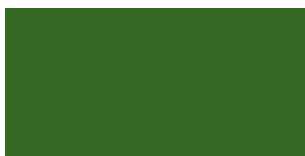
Forest Green 754