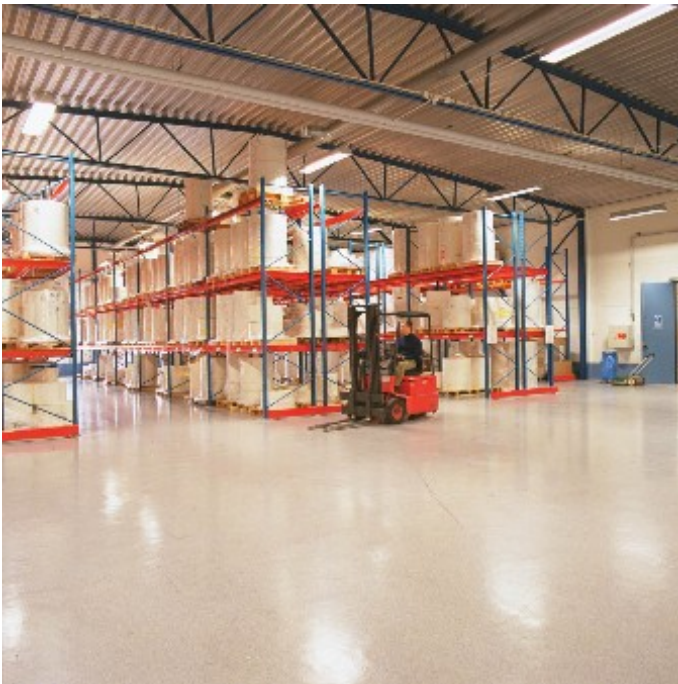
Standard colour chart